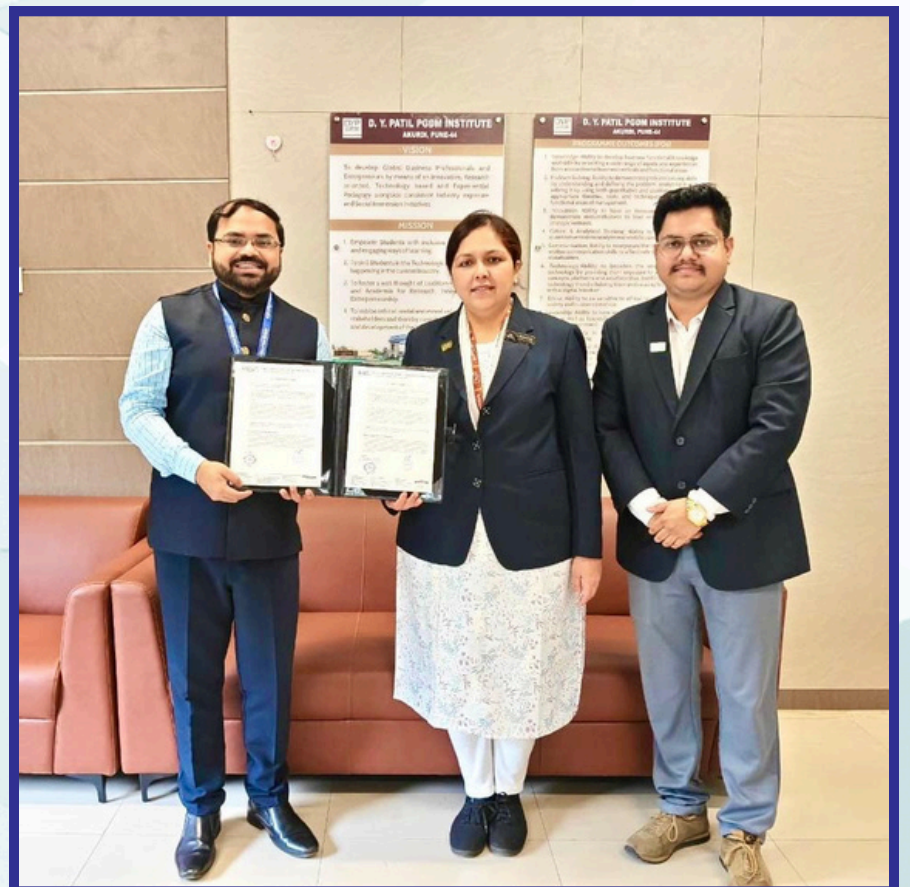
D Y Patil, PGDM Institute, Akurdi, Pune