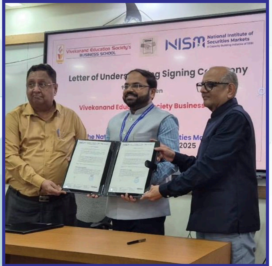
Vivekanand Education Society's Business School, Mumbai