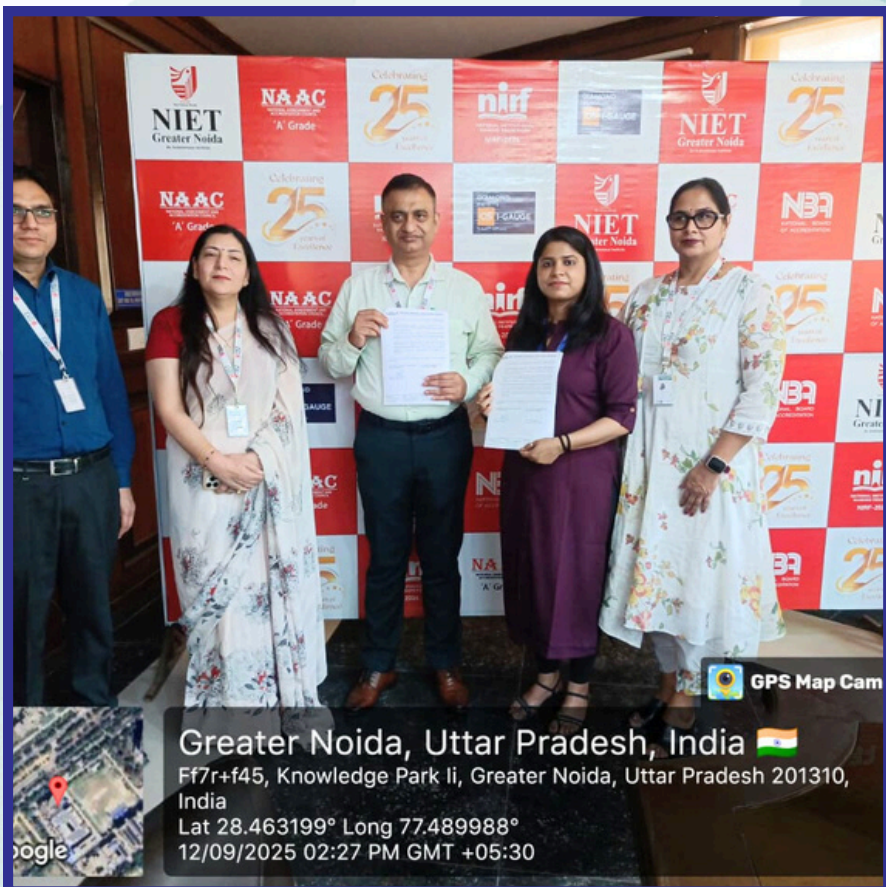
Noida Institute of Engineering and Technology, U.P