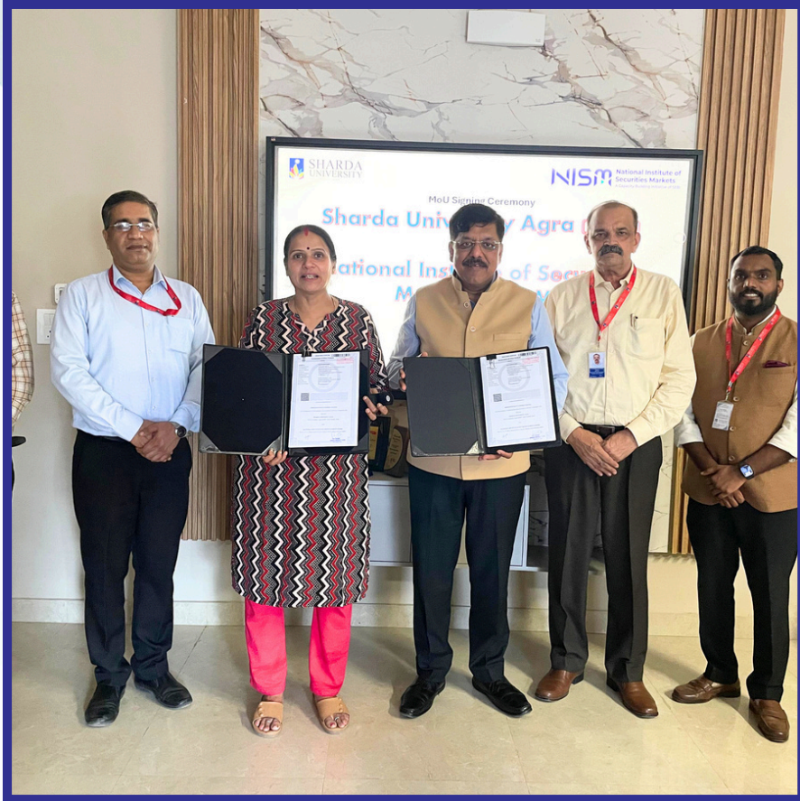
Sharda University, Agra