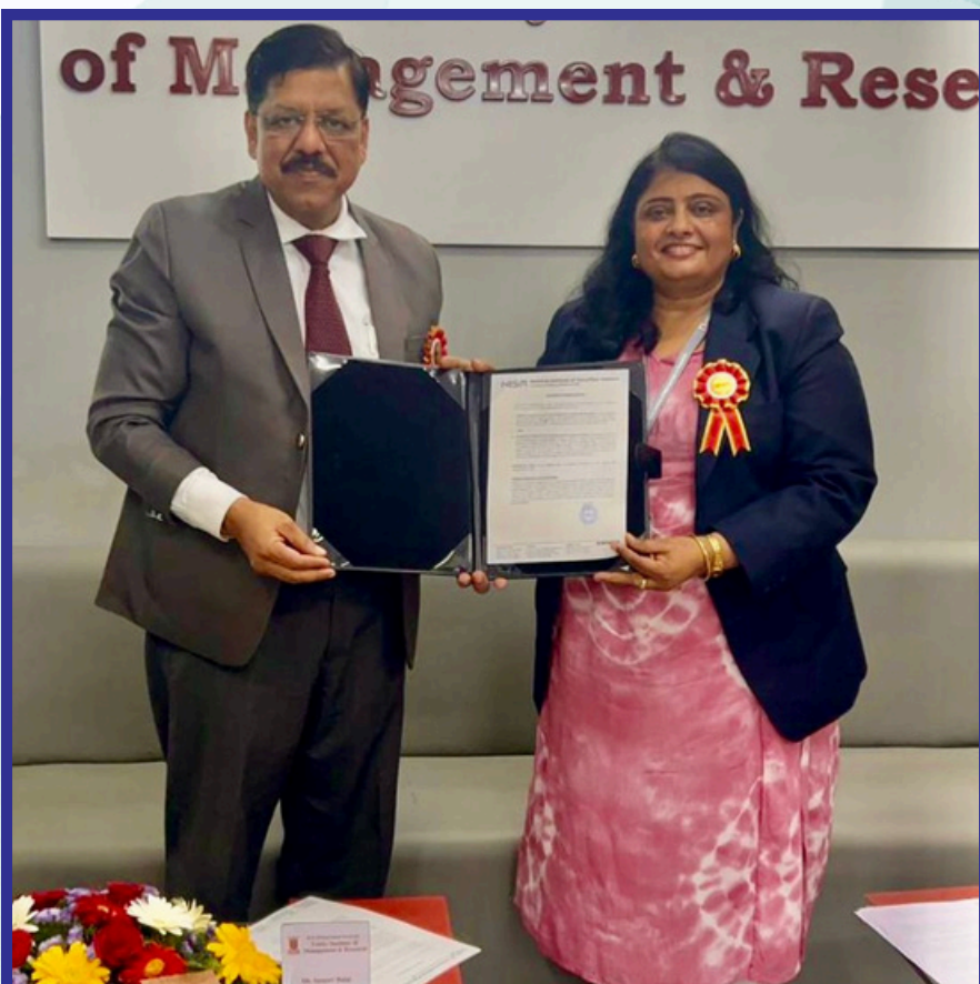
Trinity Institute of Management & Research TIMR, Pune