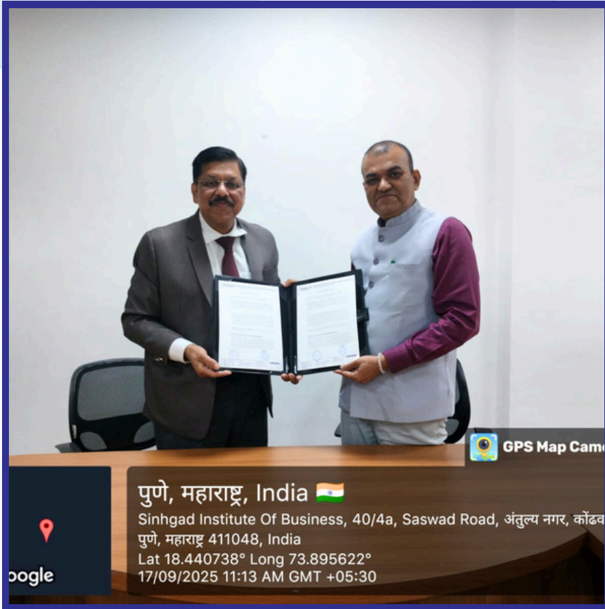
STES's Sinhgad Institute of Business Administration & Research, Pune