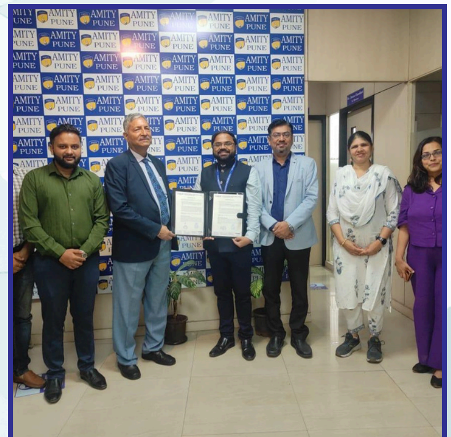
Amity Global Business School, Pune