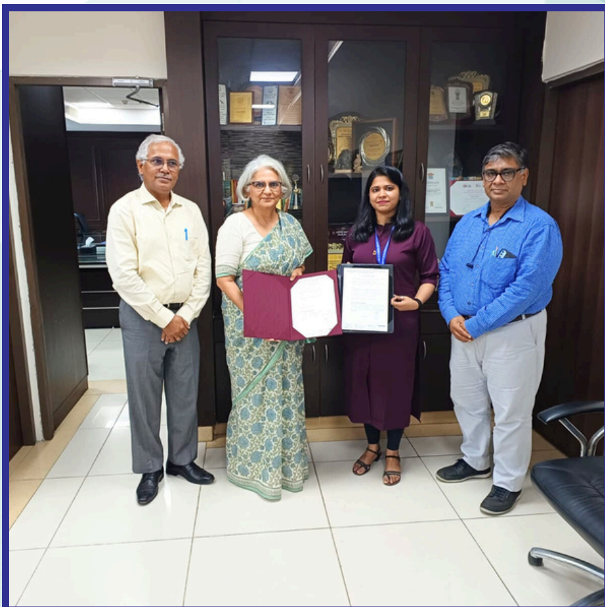
Shaheed Sukhdev College Of Business Studies, New Delhi