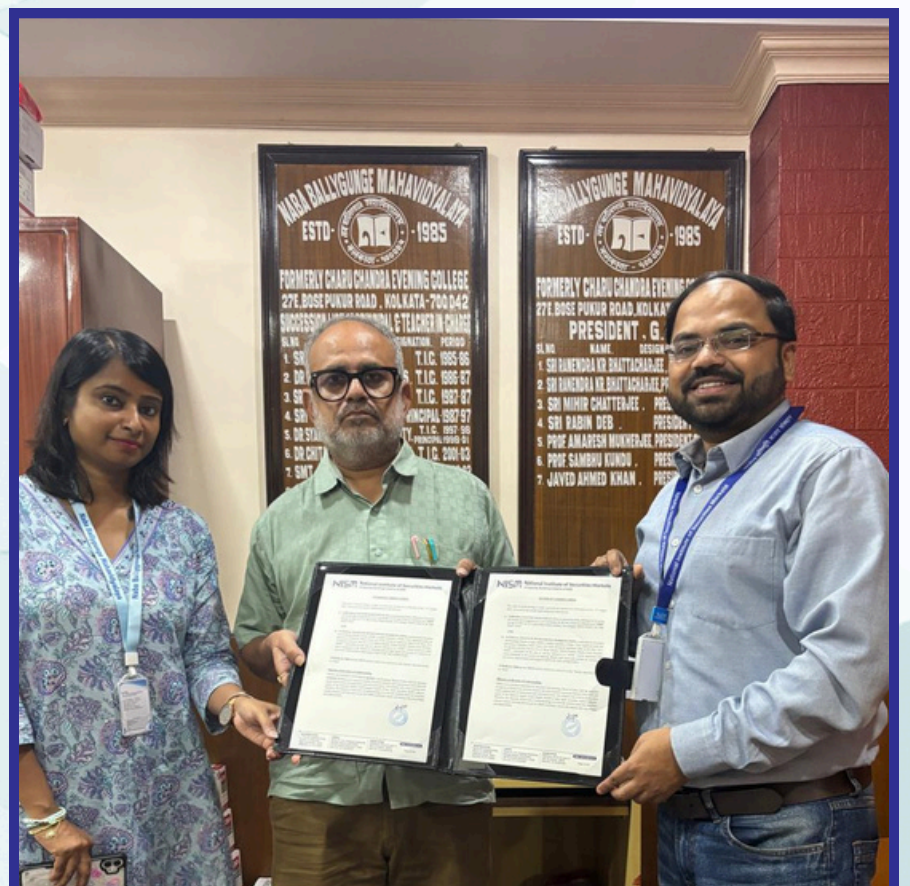
Naba Ballygunge Mahavidyalaya, Kolkata