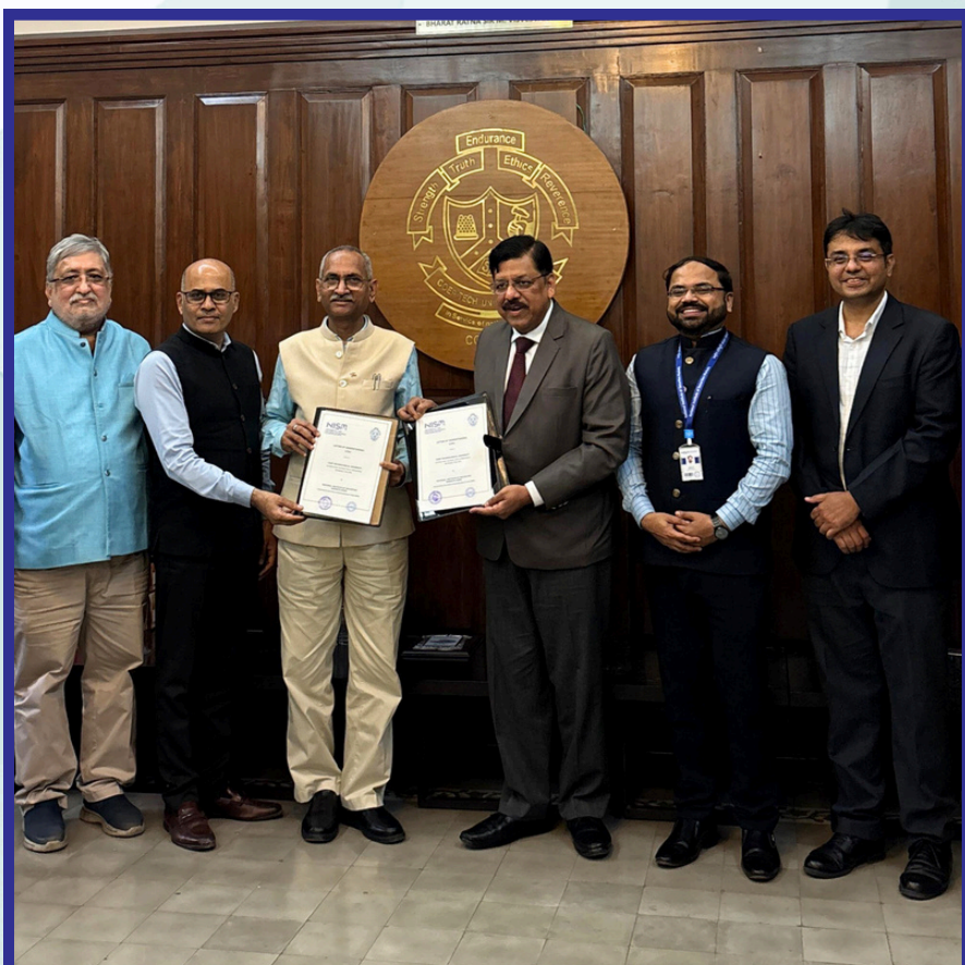
COEP Technological University, Pune