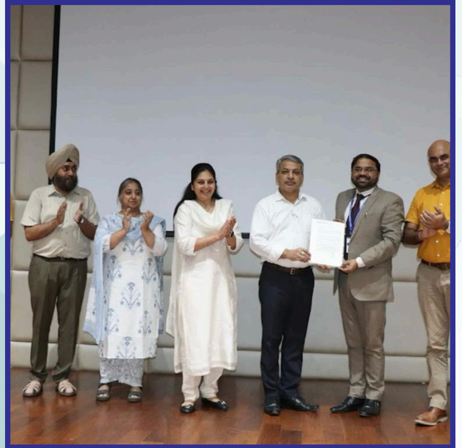
L M Thapar School Of Management, Punjab