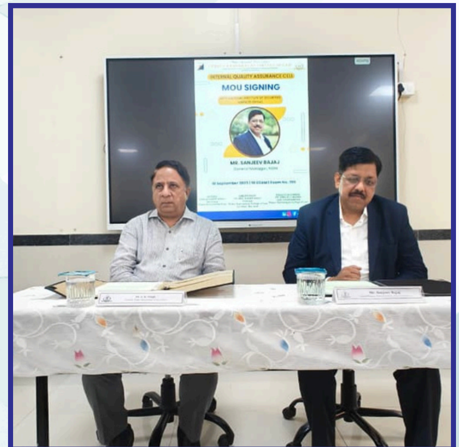
Thakur Ramnarayan Law College, Mumbai