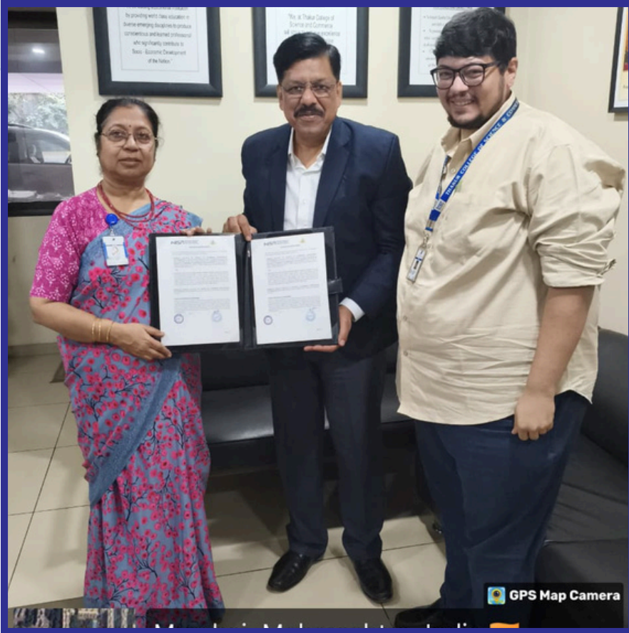
Thakur College Of Science & Commerce, Mumbai