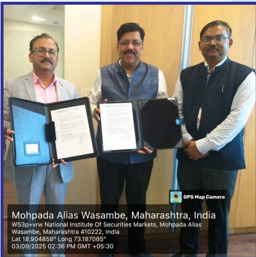
MIT WPU, Pune