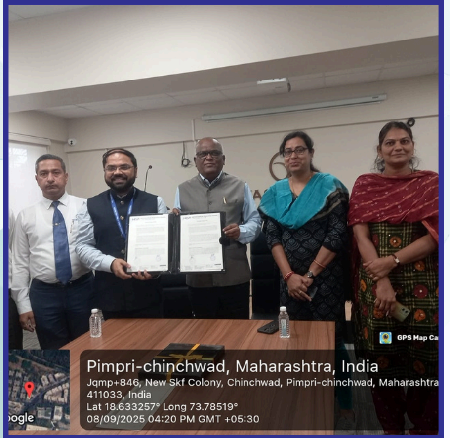
Yashaswi's International Institute Of Management Science, Pune