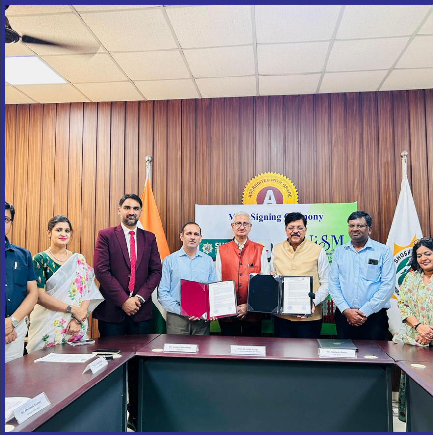
Shobhit Institute of Engineering And Technology, Meerut