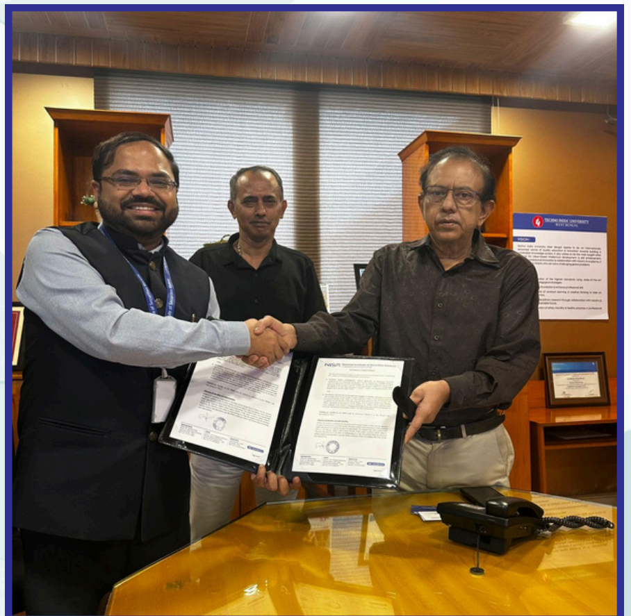
Techno India University, West Bengal