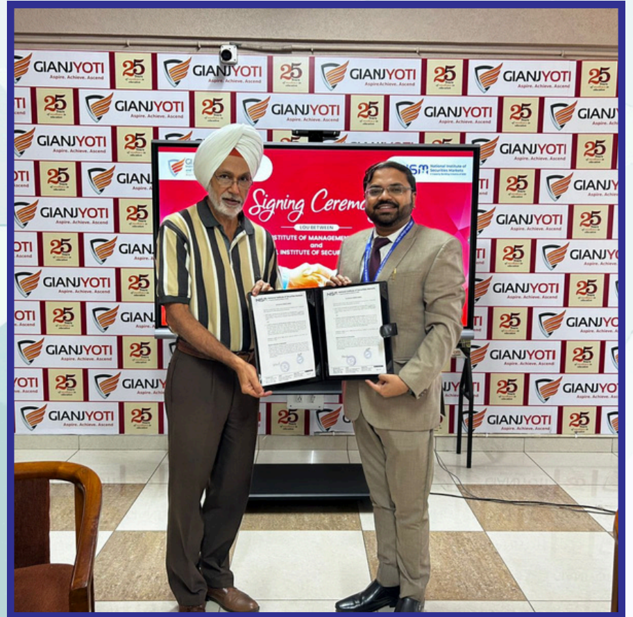
Gian Jyoti Institute Of Management & Technology, Punjab