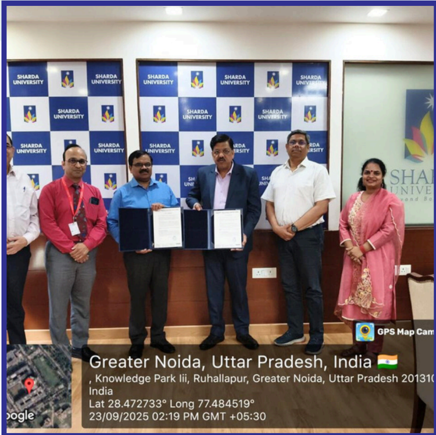
Sharda University, Greater Noida