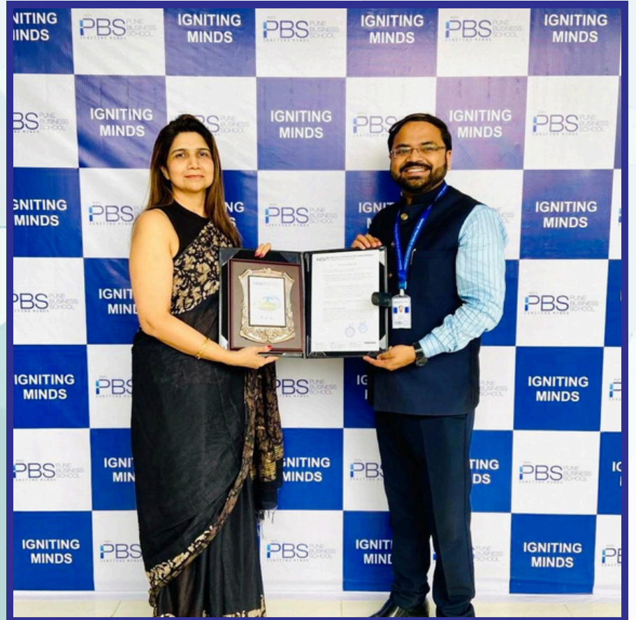
Pimpri Chinchwad Education Trust's Pune Business School, Pune