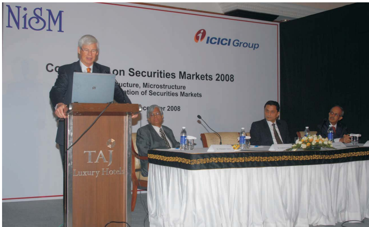
Professor Robert Engle (Nobel Laureate, 2003) delivering keynote address at the conference