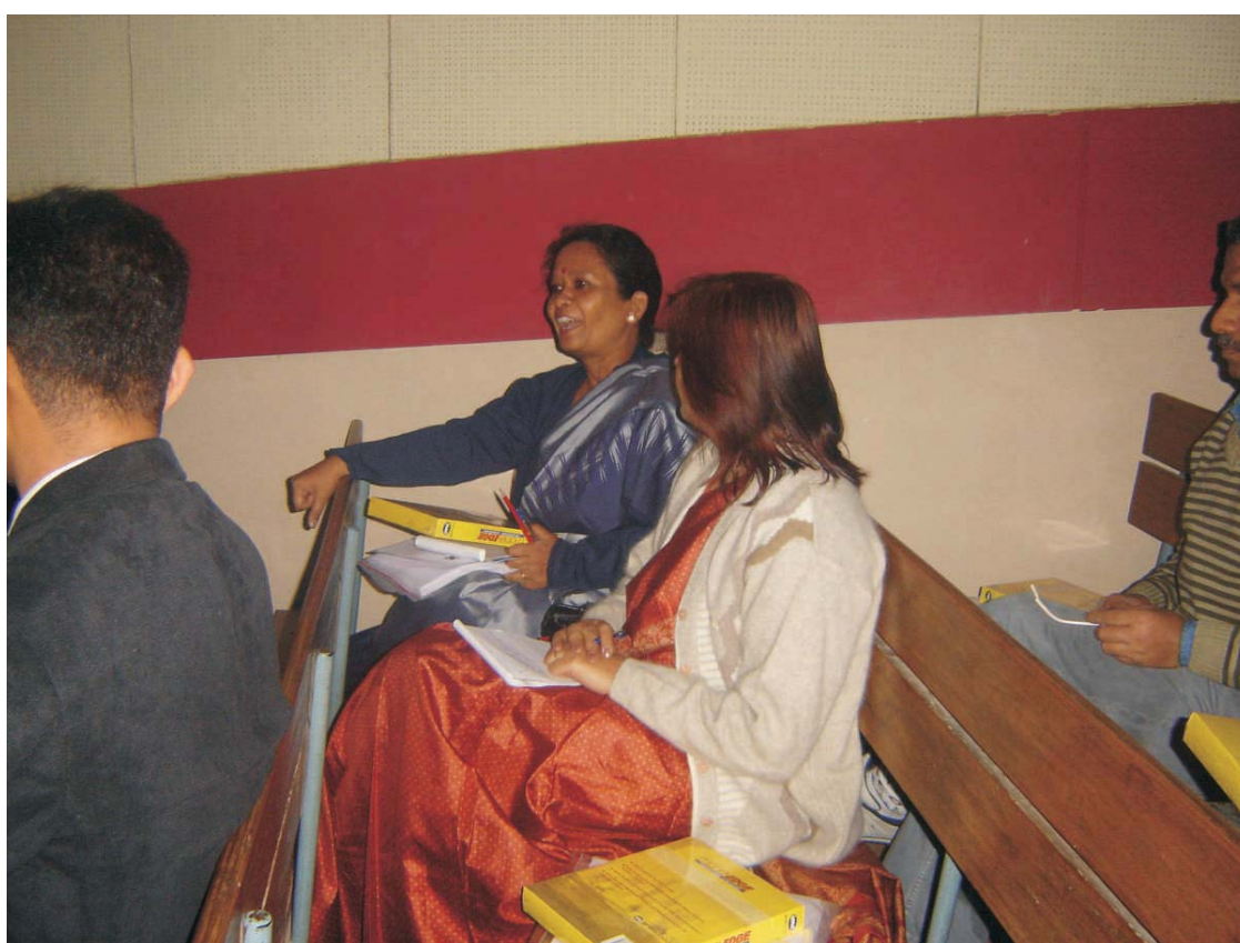
Teachers Training Programmes organised by NISM