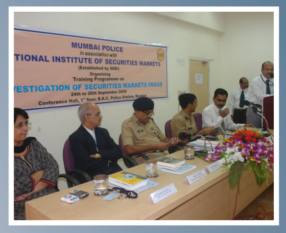
Training Programme on Investigation of Securities Markets Fraud (September 2009)