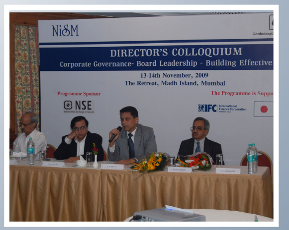
Training of Trainers Programme for Corporate Governance (January 2010)