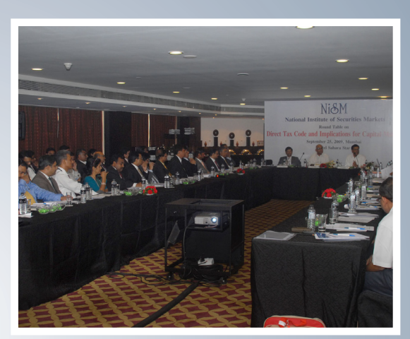
Direct Tax Code and Implications for Capital markets (September 2009)