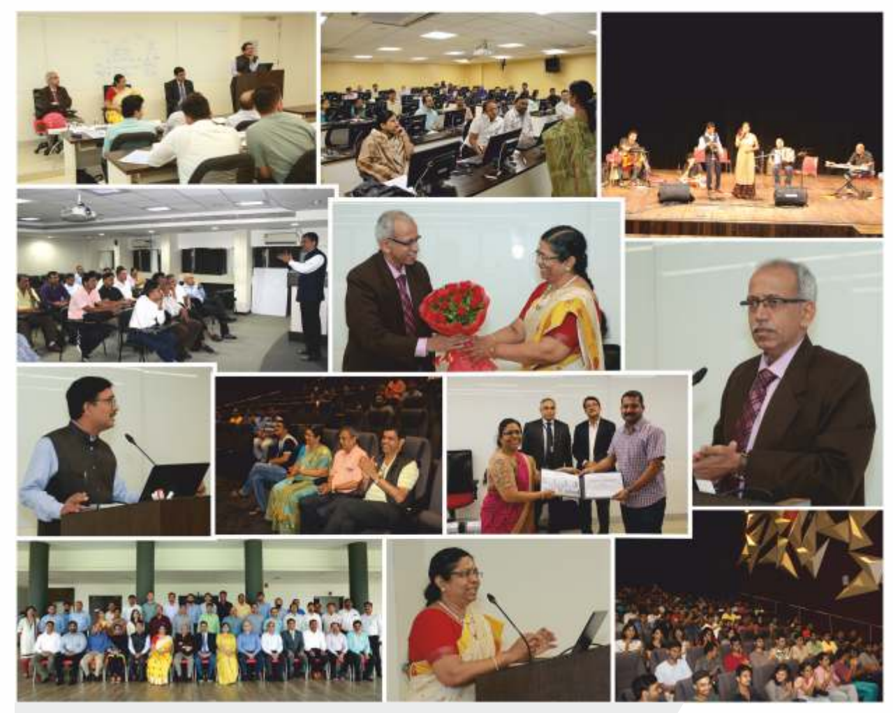
Programme on Investigating Economic Crimes in Securities Markets for Revenue Officers

A programme on Investigating Economic Crimes in Securities Markets for Revenue Officers. July 09-13, 2018 | NISM Campus, Patalganga.