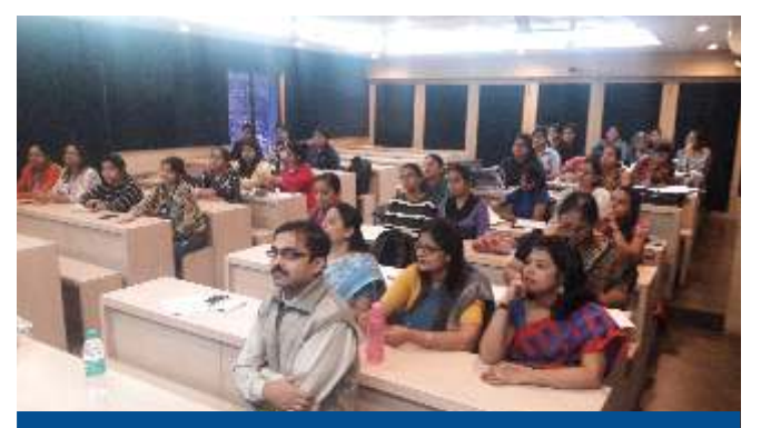
Shikshayatan College, Kolkata