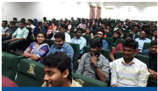
Thiagarajar College of Management