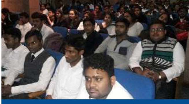
Surendranath Law College, Kolkata