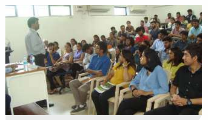
S S Dempo College of Commerce & Economics, Bambolim, Goa