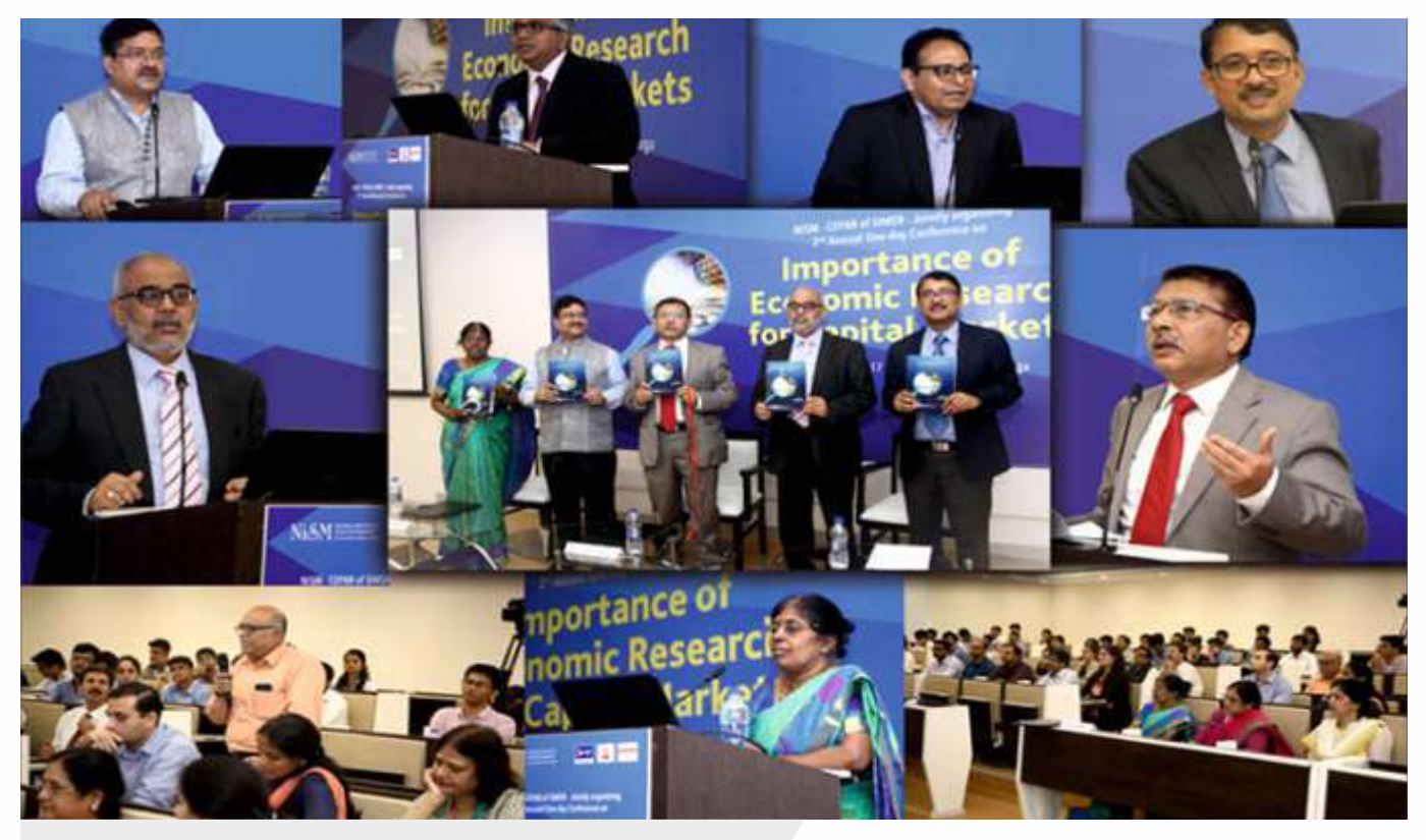
Conference on 'Importance of Economic Research for Capital Markets'

The objective of this Conference was to deliberate on current state of macroeconomic research related to capital markets.