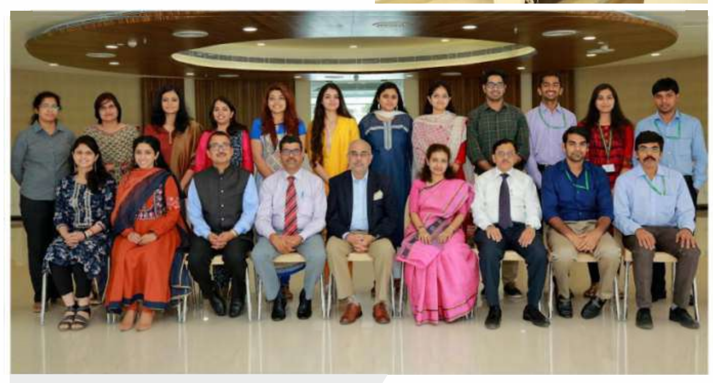
Programme on 'An Overview of Securities Markets' for IES officers