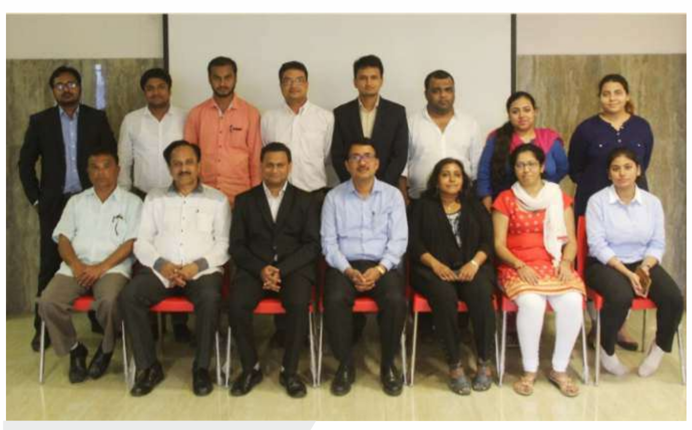
Programme on Basic Derivatives for market participants

NISM conducted a 2-day Programme on Basic Derivatives during November 13-14, 2017 at NISM Bhavan, Vashi, Navi Mumbai.