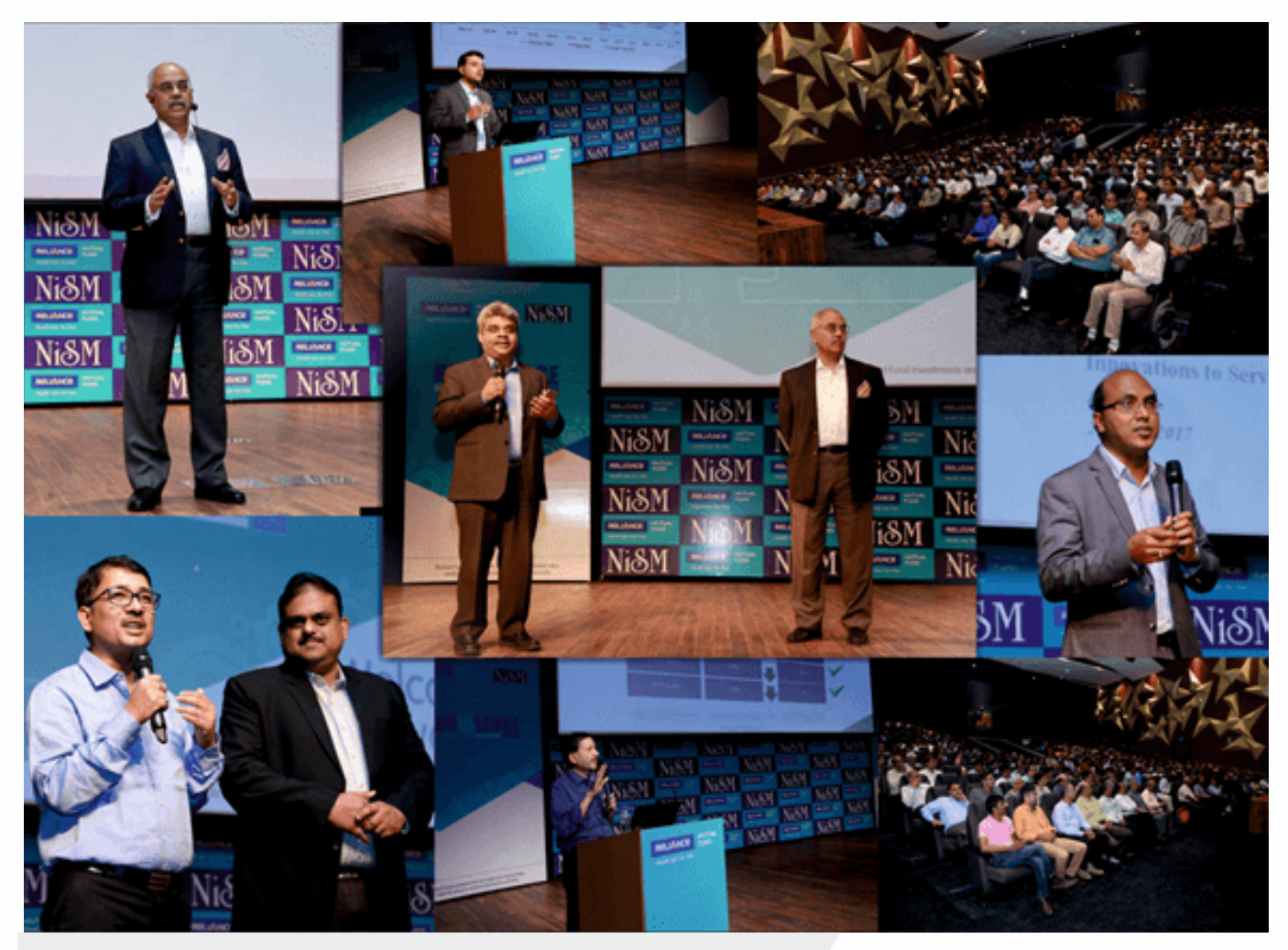
Reliance Mutual Fund Distributors Engagement Programme for market participants

The programme was well received by the participants and they suggested that such programme should be conducted on regular intervals.