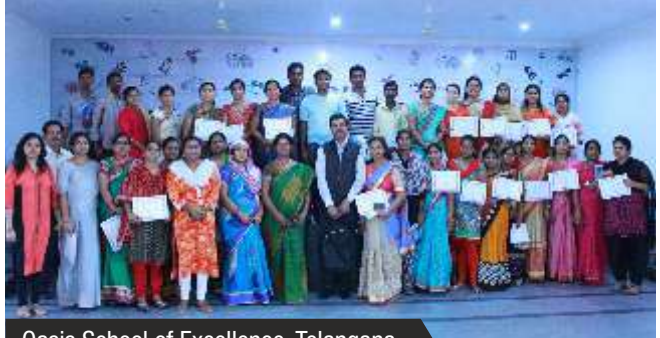
Oasis School of Excellence, Telangana