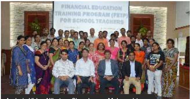
Ambuja Vidya Niketan, Chandrapur, Maharashtra