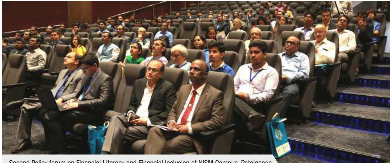
Second Policy forum on Financial Literacy and Financial Inclusion at NISM Campus, Patalganga

Delegates from Financial Sector Regulators, Market Participants, Intermediaries, Management institutions, Non Governmental Organizations etc. from all parts of the country and abroad participated in the Second Policy Forum on Financial Literacy and Financial Inclusion.