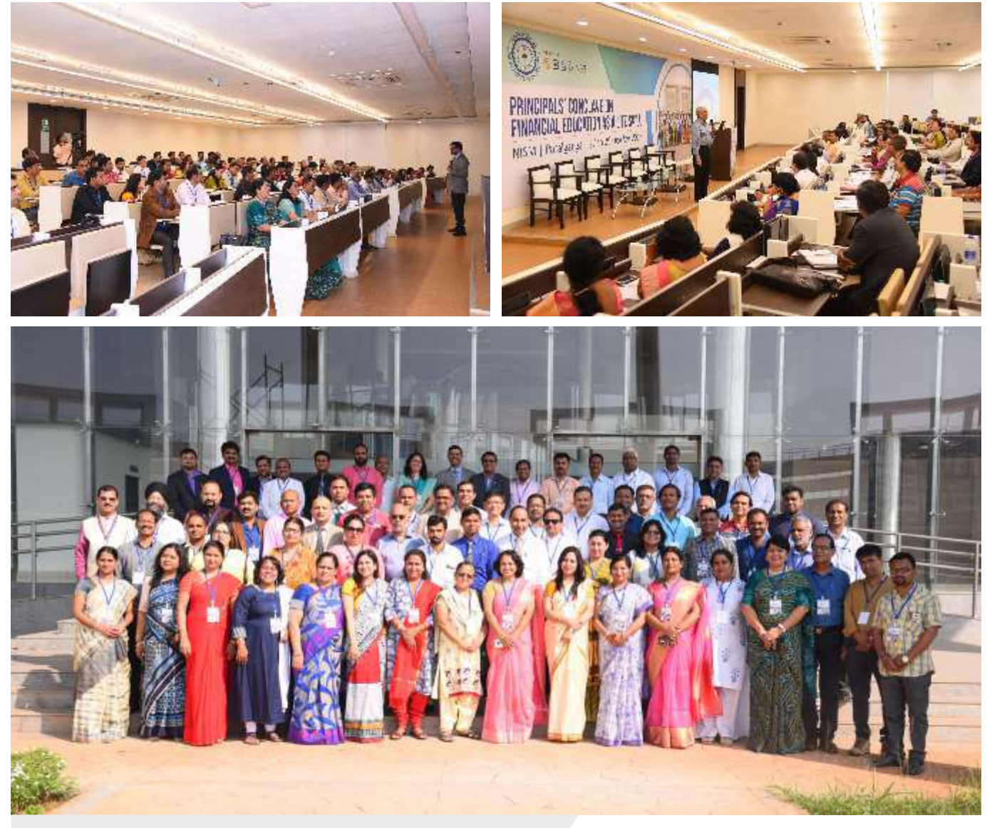
Principals' Conclave on Financial Education at NISM Campus, Patalganga

Around 70 Principals from different schools across the country participated in the Principals' Conclave. The highlights of the "Principals' Conclave on Financial Education as a Life Skill" are as follows: