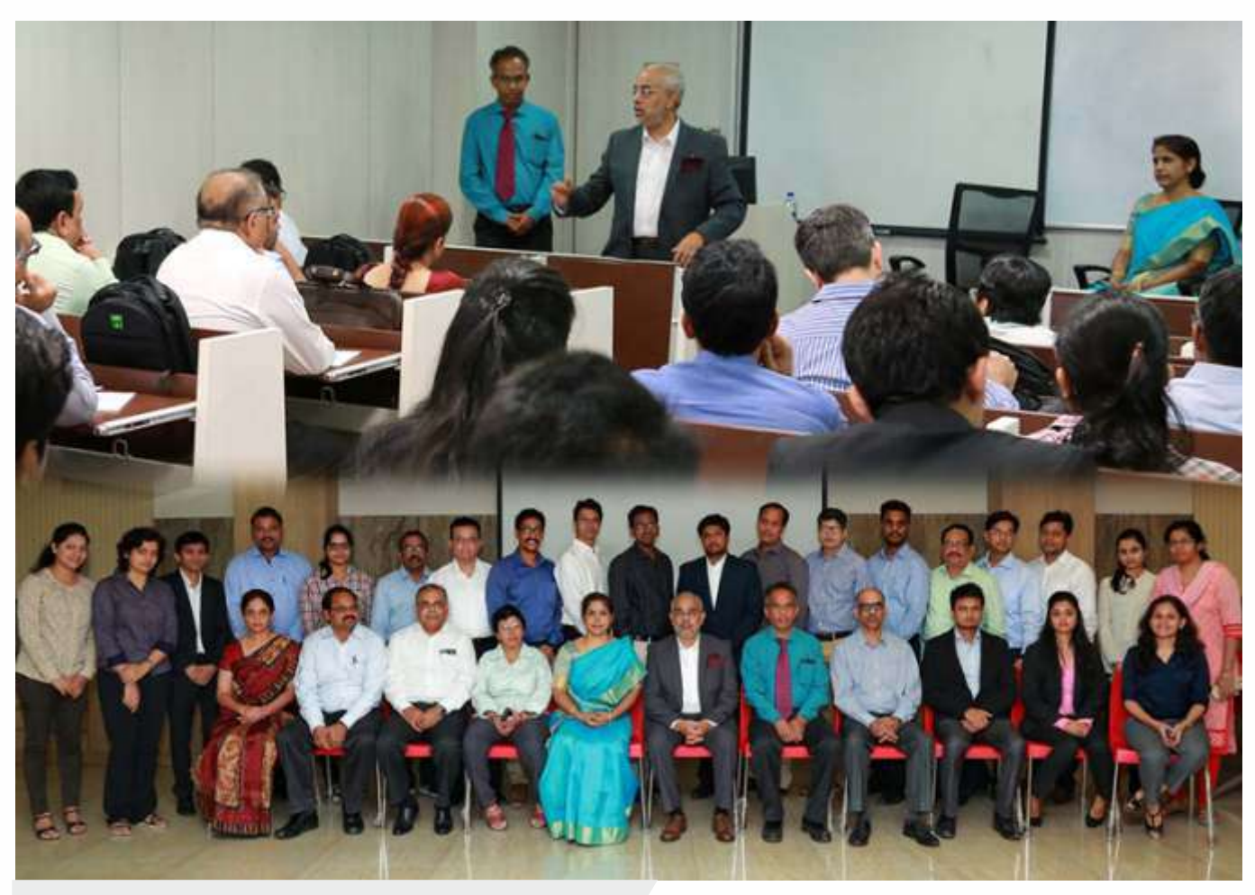
Workshop on 'Role of Compliance Officers of Listed Companies'

NISM in association with the Institute of Company Secretaries of India-Centre for Corporate Governance Research and Training (ICSI-CCGRT) had conducted a two-day Workshop on 'Role of Compliance Officers of Listed Companies' on November 17-18, 2017 at NISM Bhavan, Navi Mumbai.