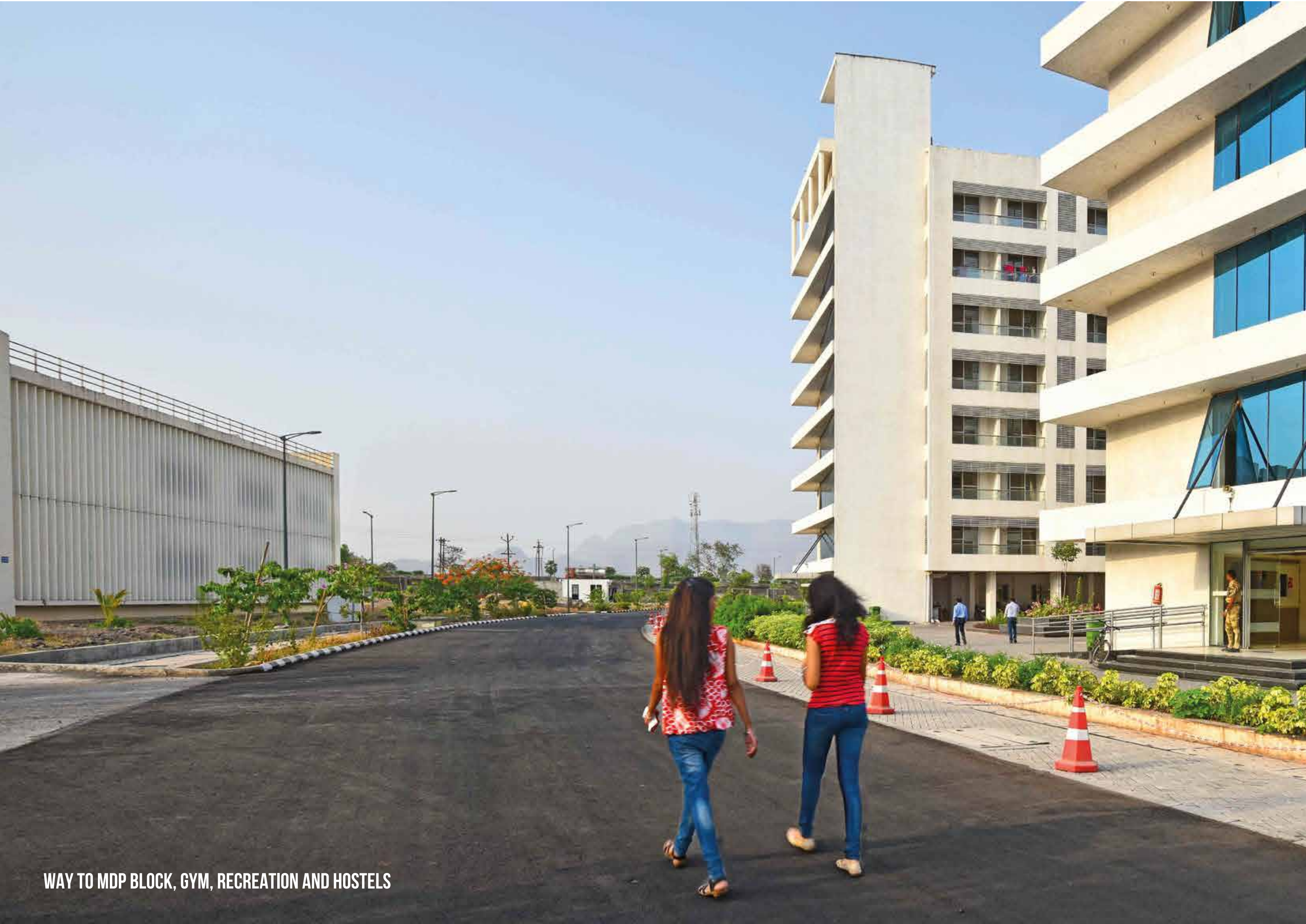
WAY TO MDP BLOCK, GYM, RECREATION AND HOSTELS