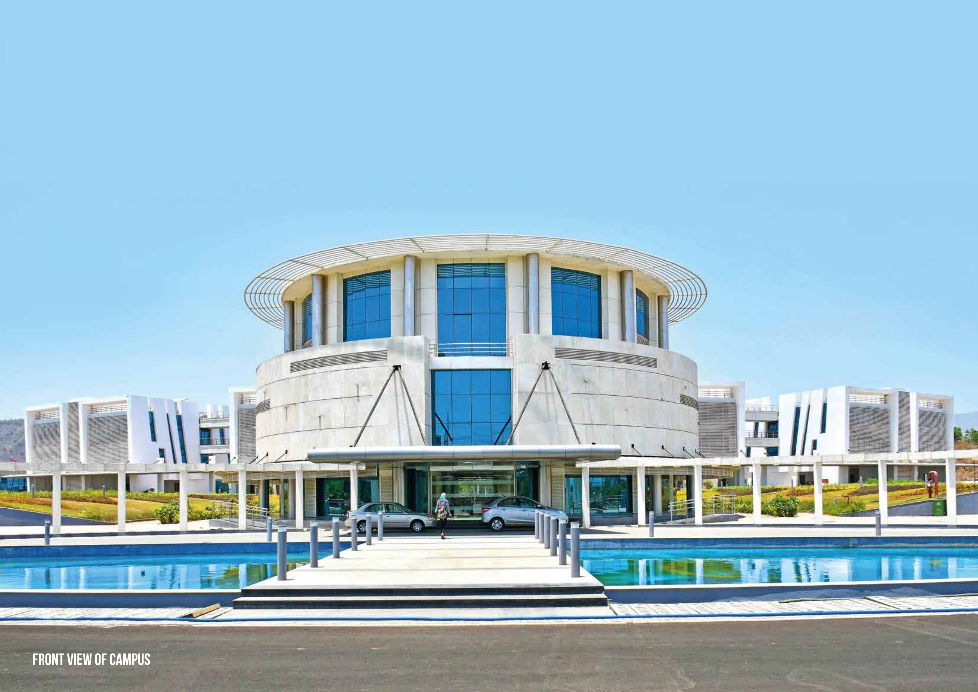
FRONT VIEW OF CAMPUS