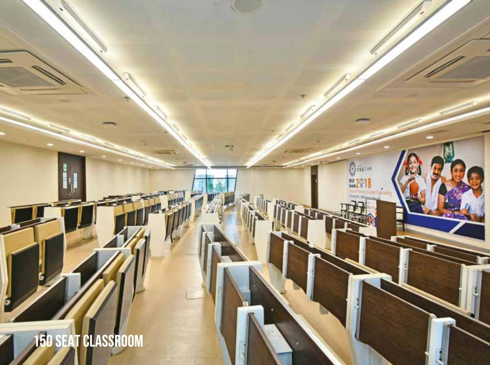
150 SEAT CLASSROOM