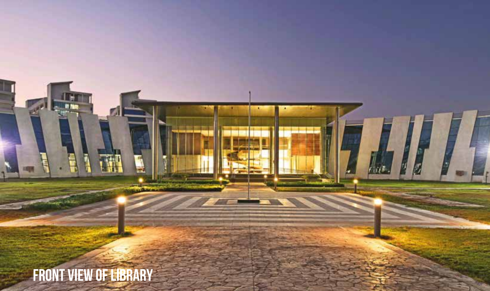
FRONT VIEW OF LIBRARY