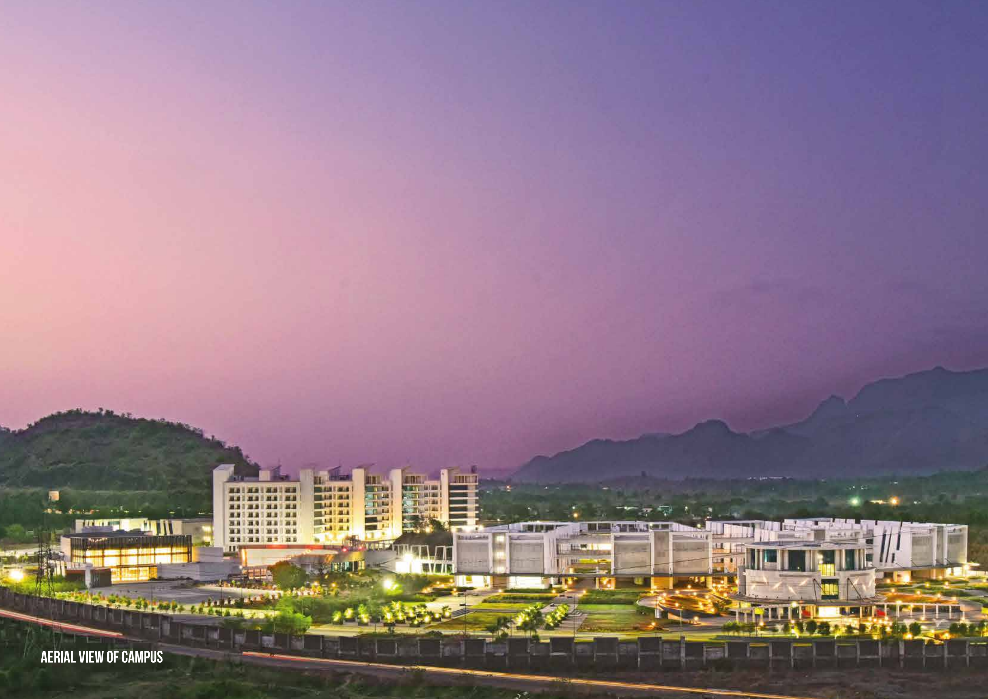
AERIAL VIEW OF CAMPUS