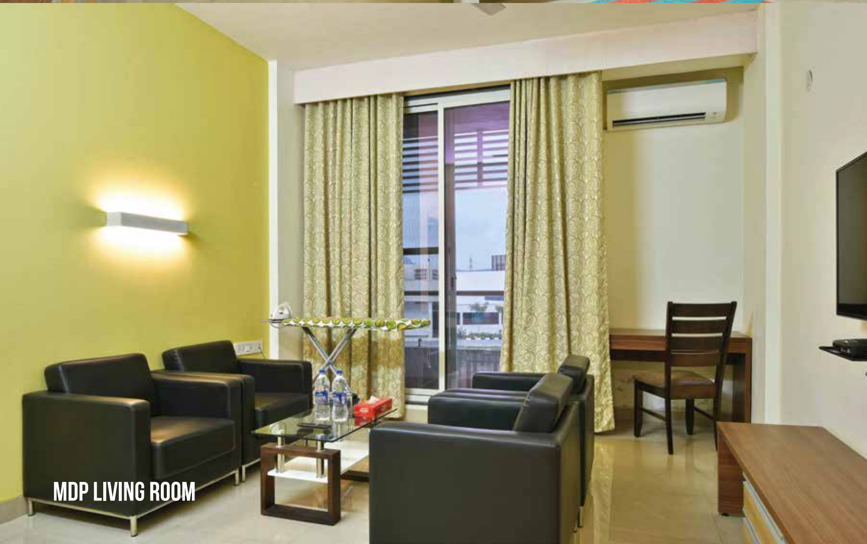
MDP LIVING ROOM