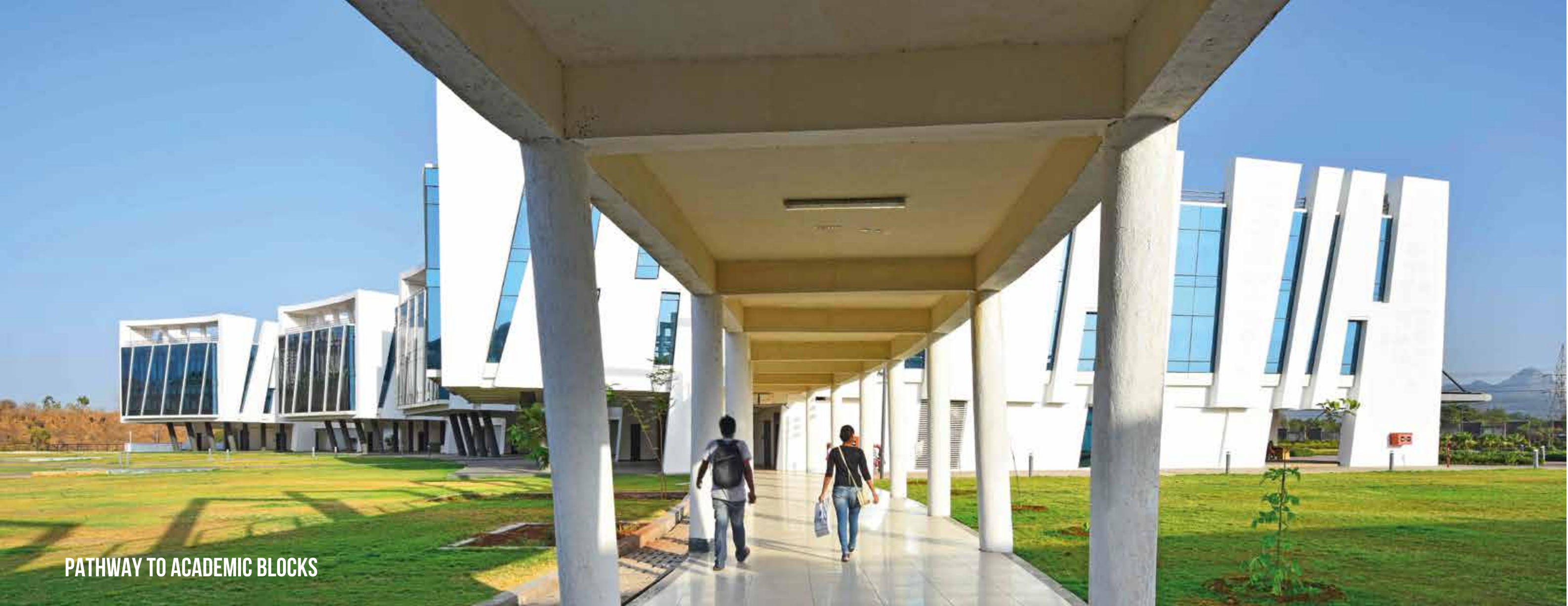
PATHWAY TO ACADEMIC BLOCKS