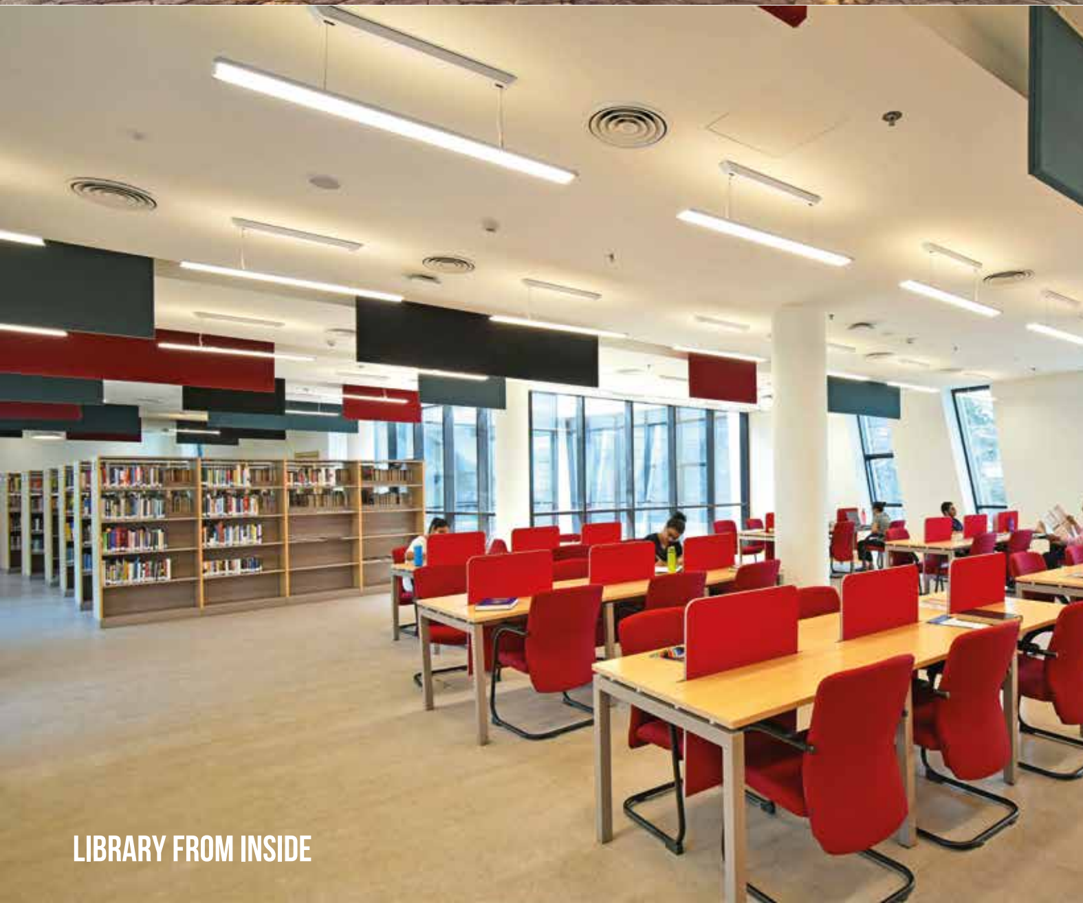
LIBRARY FROM INSIDE