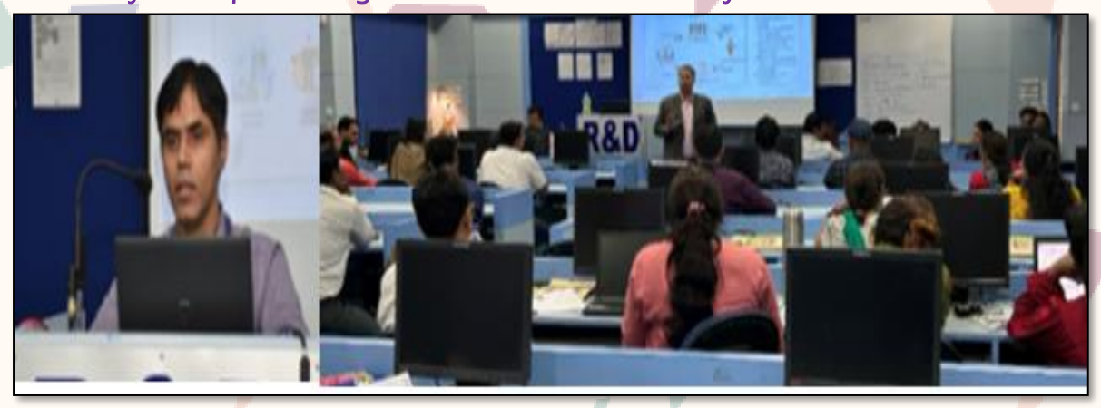
Faculty Development Program in collaboration with Aditya Birla Sunlife Mutual Fund

A Faculty Development Program (FDP) was conducted in collaboration with Aditya Birla Sunlife Mutual Fund (ABSLMF) on the topic of "Investing in Capital Markets" at Shri Vaishnav Vidyapeeth Vishwavidyalaya, Indore on March 25, 2023. The theme of the FDP was "Investing for Amrit Kaal – India@100 Years." The attending faculty members were briefed and taken through five sessions on the Importance of investing in Capital Markets to achieve various financial goals, beats inflation and make India ready for Amrit Kaal through sustainable investment. A total of 51 faculty members from different teaching streams attended the program.