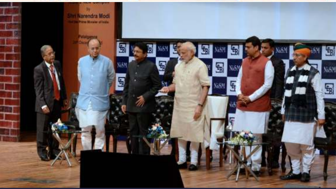
Inauguration of NISM's state-of-the-art Campus at Patalganga by Shri. Narendra Modi, Hon'ble Prime Minister of India.