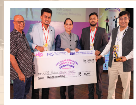
3rd Prize Rs. 60,000/- ICFAI Business School, Kolkata