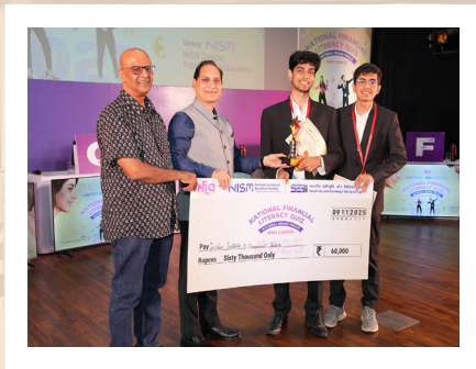
3rd Prize Rs. 60,000/- Indian Institute of Management Indore, (IIM Indore)